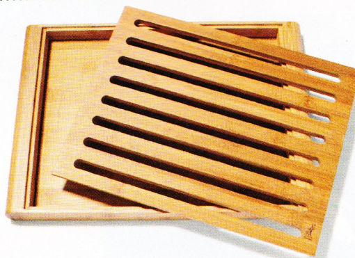
The couple keeps a crumb board like this one in reach for all their Tuscan breads. $29, Island Bamboo ; casa.com